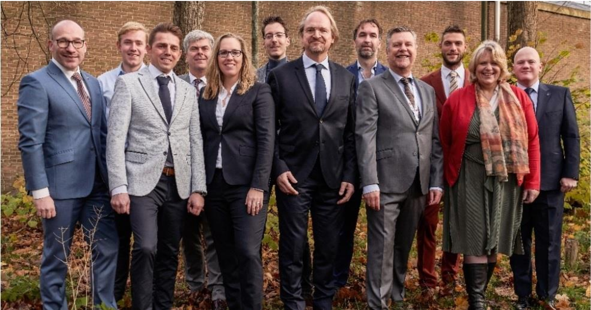
photo from FVD website presenting candidates for Provincial council elections on March 15 th 2023

https://fvd.nl/nieuws/fvd-maakt-lijsttrekkers-provinciale-statenverkiezingen-2023-bekend